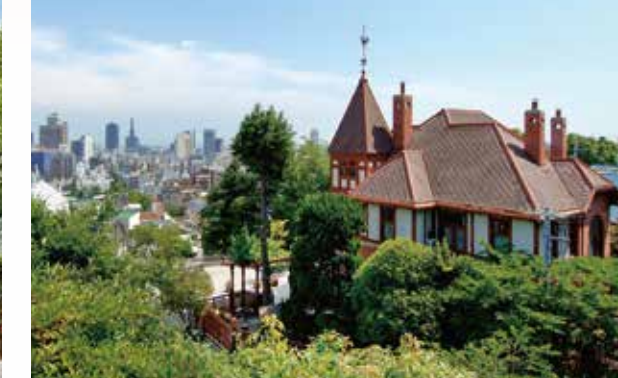
Kitano Ijinkan (Former Foreign Residences)